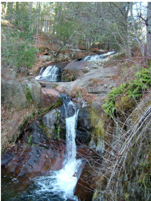
Statons Creek Falls, Pedlar Ranger District.