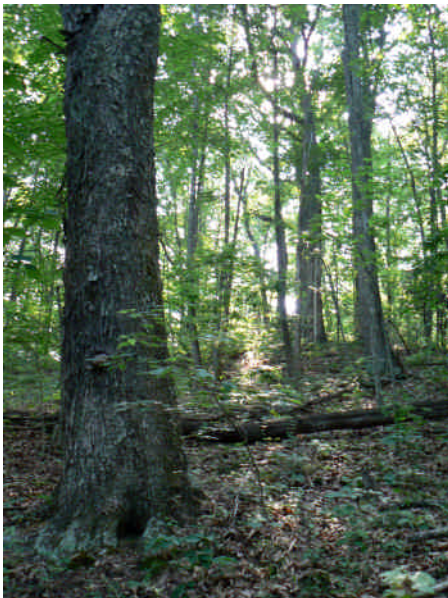
Proposed Back Valley timber sale, Clinch Ranger District

In other news, industrial wind facility developers are contemplating new wind facilities on about 10 miles along the northern border of Rockingham County, and on over ten miles on Great North Mountain between Rt. 691 and Church Rock.