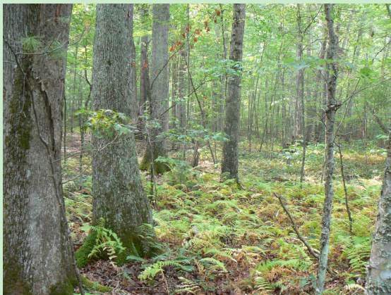
Back Draft area, Walker Mountain

We will meet and depart at 10AM, May 30, at the parking lot of the Holiday Inn north of Staunton. At Interstate 81, Exit 225, go north (towards Staunton) on Rt. 275. Signs to the Holiday Inn are on the right side of the road a short distance from the exit. We plan to return to the original meeting location by 5PM.