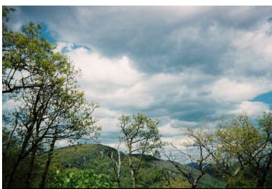
North Mountain Trail

Difficulty: Easy, with one short moderate section. Occasional small ups and downs along the ridgeline, with one section with an elevation gain of approx. 300 ft over 1/4 mile. Total length – approx. 5 mi.